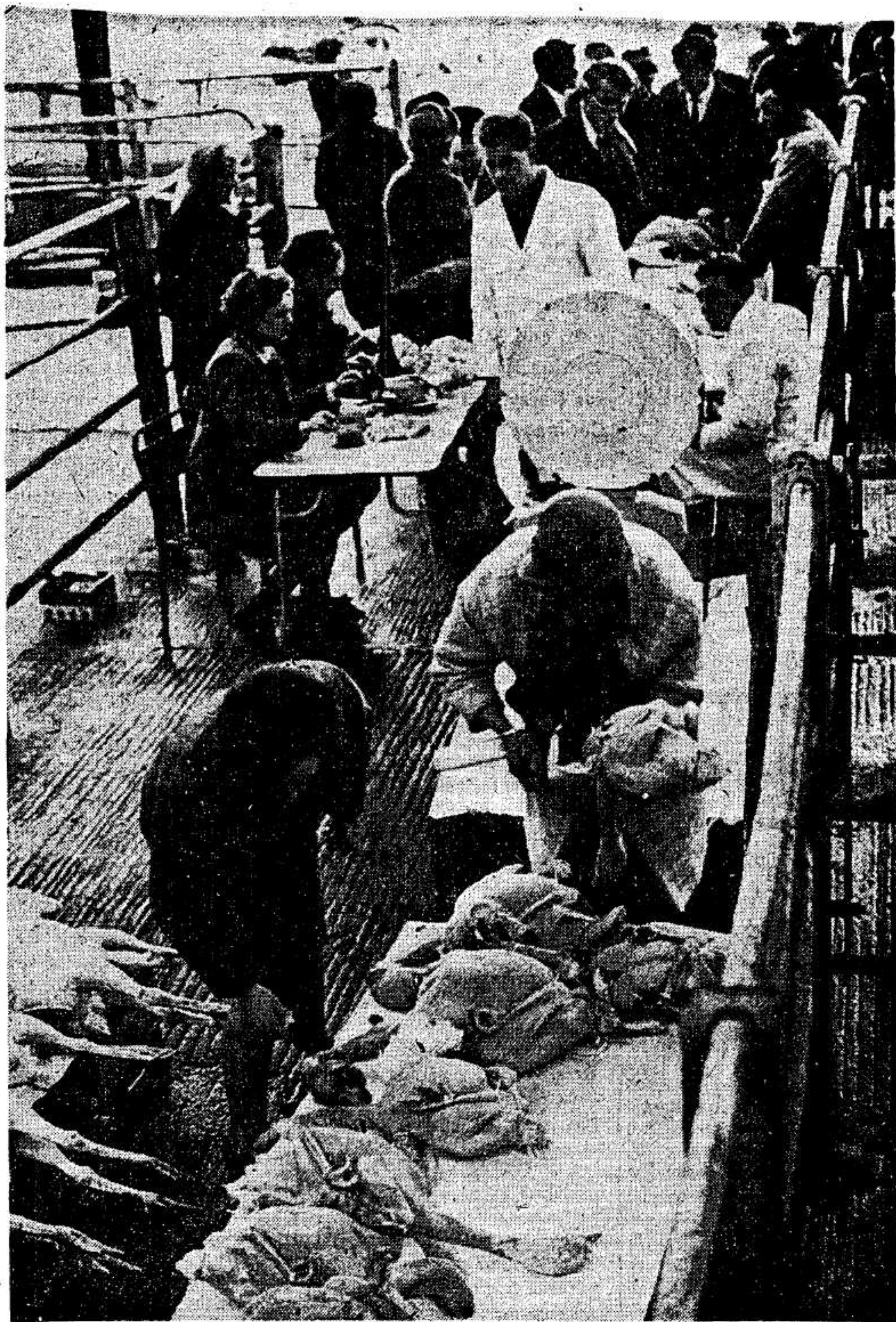
A view of the weigh-in for the Christmas turkey show and sale at the Bandon Marts, yesterday.